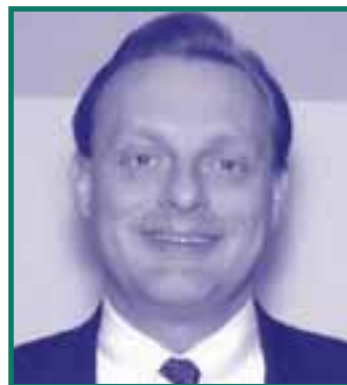
Metropolitan Council Chair Ted Mondale.

"And their confidence and self-sufficiency will pass on to other people," Governor Ventura added. "When you do become self-sufficient, you become a