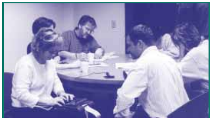
Neighborhood residents attending the I-35W open houses filled out comment cards and provided statements to a court reporter.